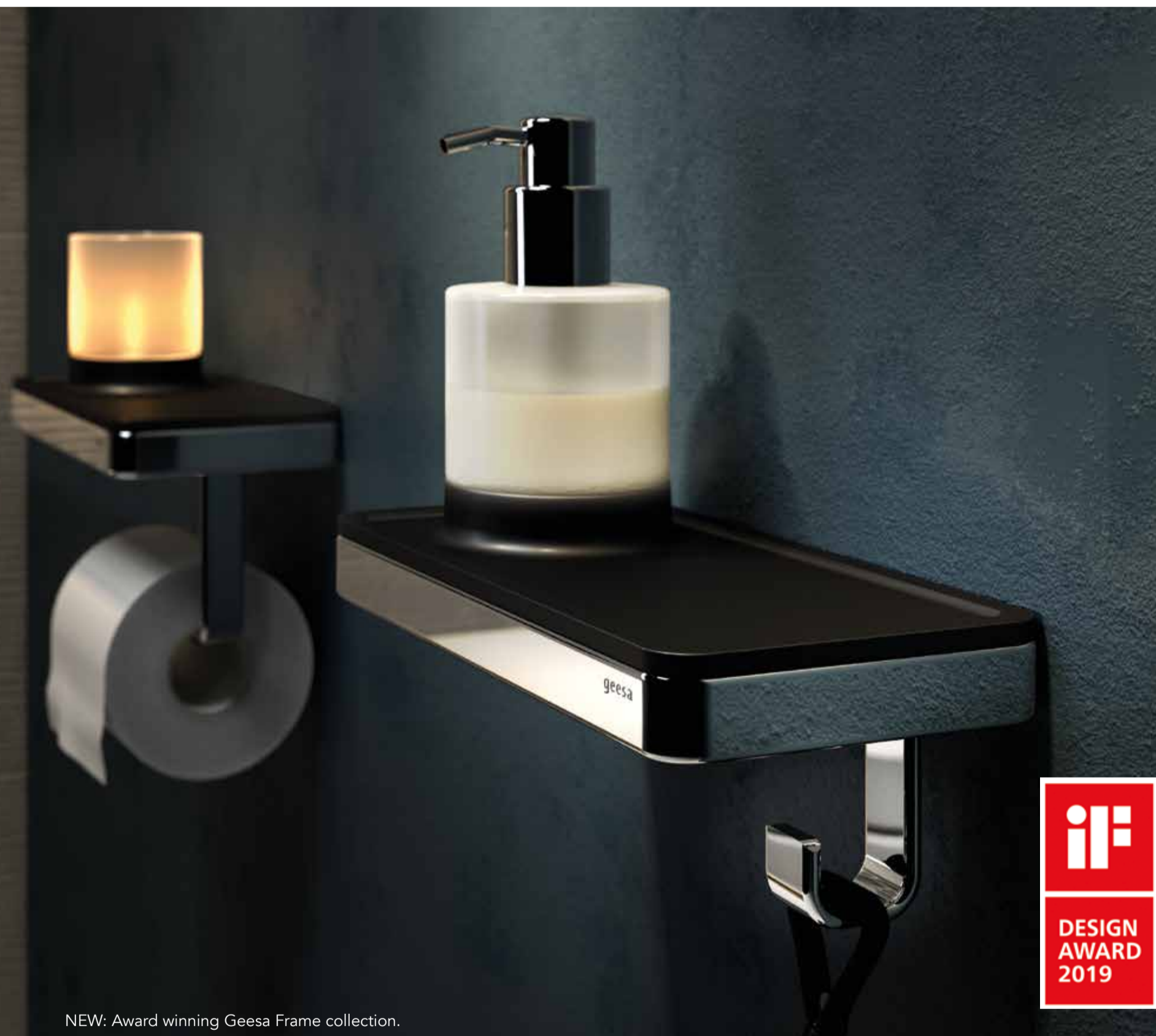
NEW: Award winning Geesa Frame collection.

Spring is the season of change. Eight Coram companies, including Geesa, Sealskin and Tiger, intensify their co-operation and merge to one Coram organisation with five Business Units (BU's): Coram DIY, Coram Benelux, Coram UK, Coram Nordic and last but not least Coram Hospitality & Projects (CH & P). In the latter business unit, the export and project activities of Geesa are combined with those of Coram Projects.