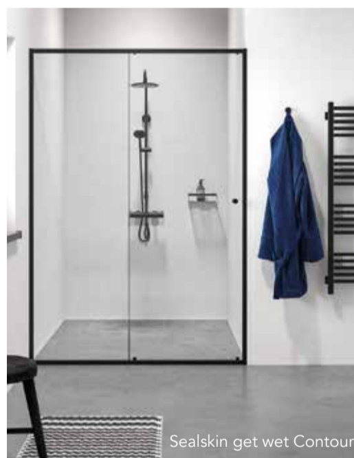
Sealskin get wet Contour