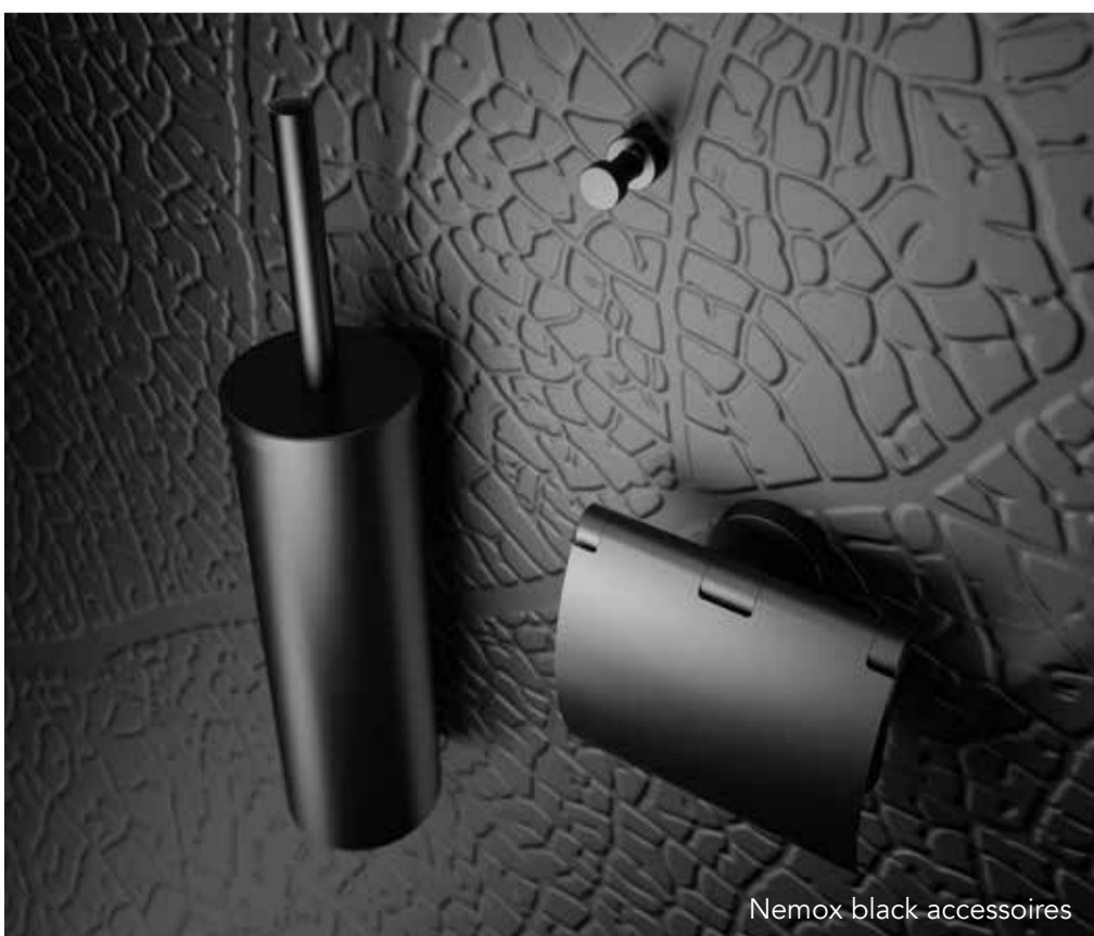
Nemox black accessoires

In combination with the bathroom accessories of the Nemox black collection and the Sealskin Soho shower you can enjoy a full matt black mysterious bathroom design. Join the trend of dark minimal.