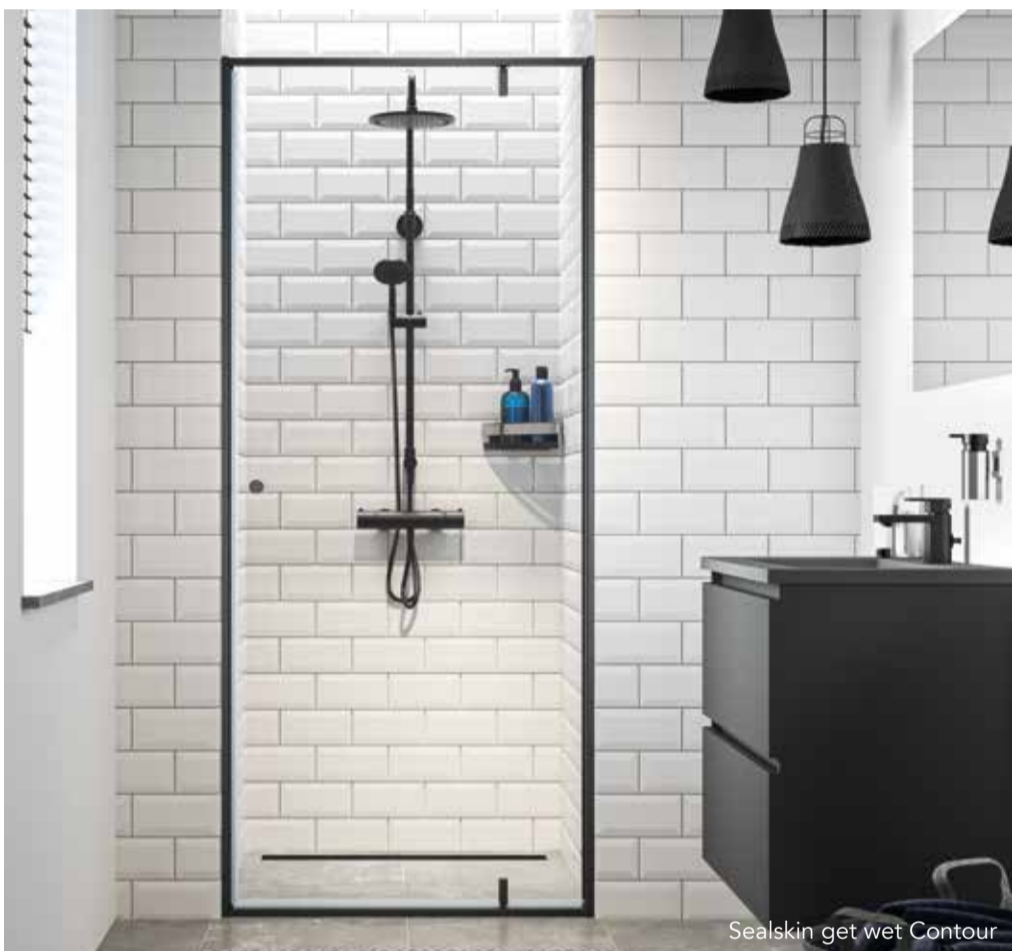
Sealskin get wet Contour

The three showers shown are only a fraction of the possibilities that Coram offers with the Sealskin brand. The brand distinguishes itself by paying particular attention to details. Both in its products and in its support. The brand is leading in showers both in professional retail and DIY in the Benelux.