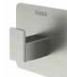
Tiger Pull Square