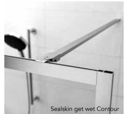
Sealskin get wet Contour