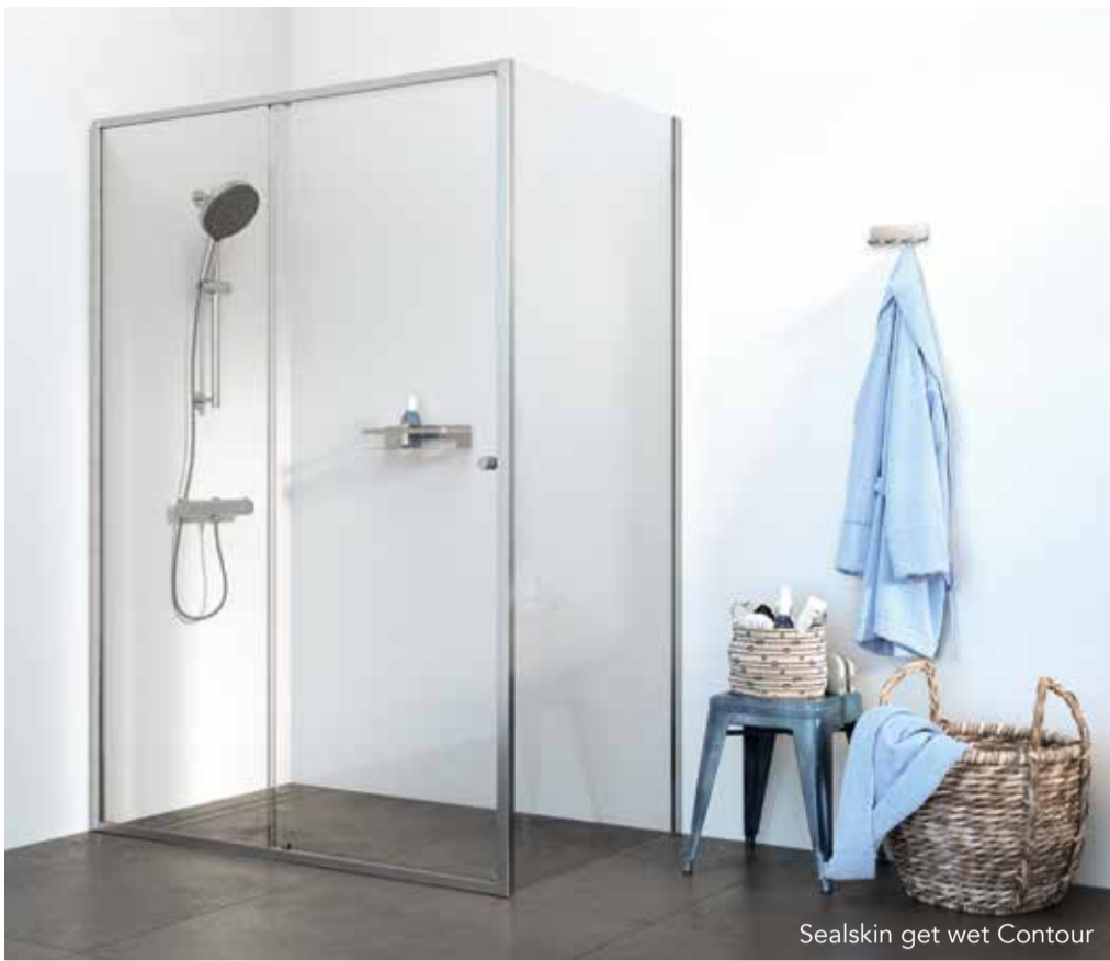
Sealskin get wet Contour