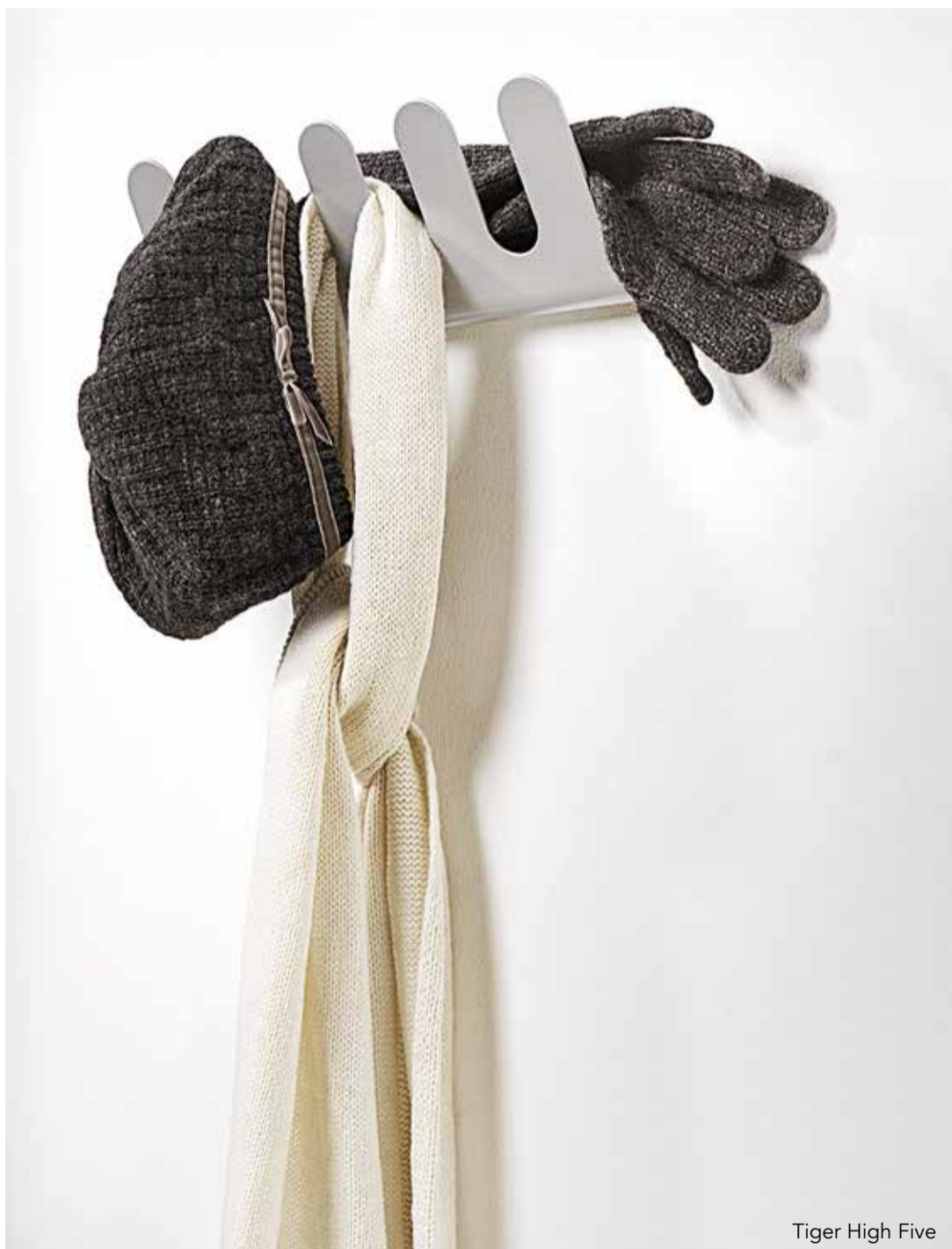
Tiger High Five