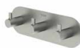
Tiger Rhino Rack