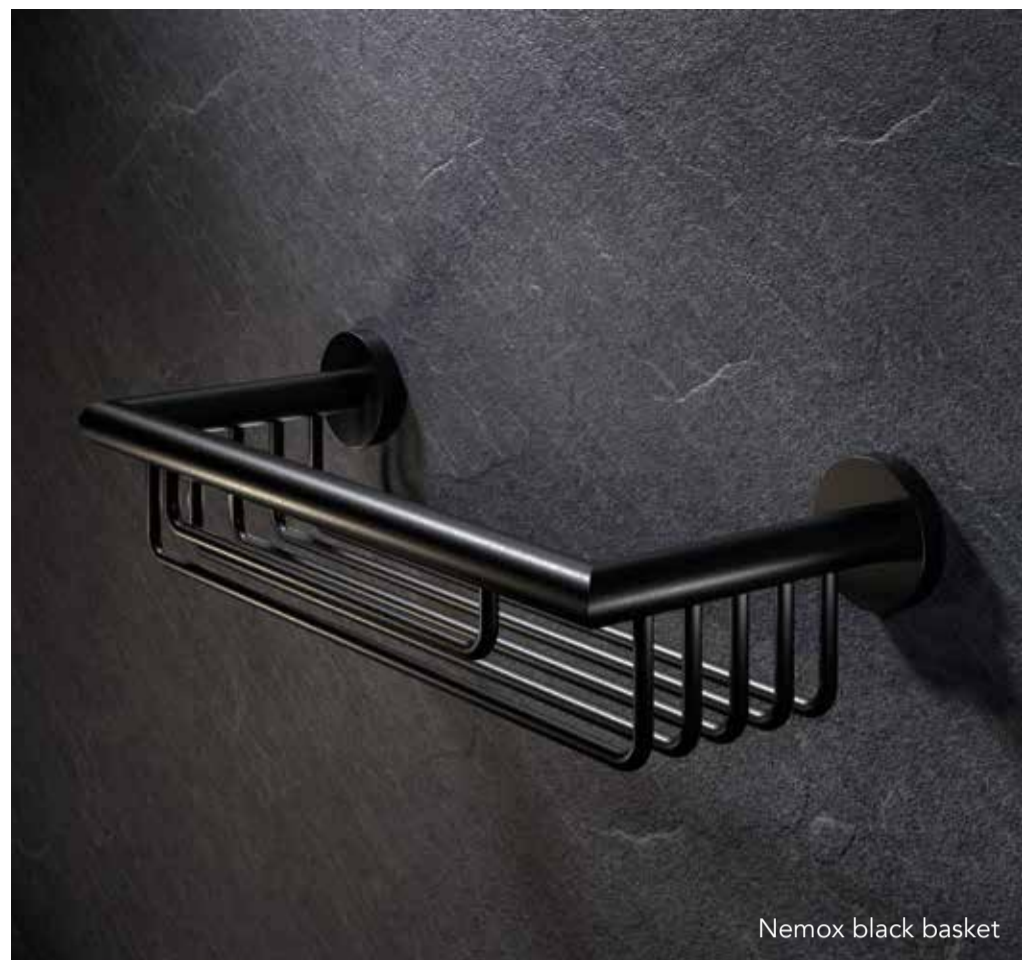
Nemox black basket