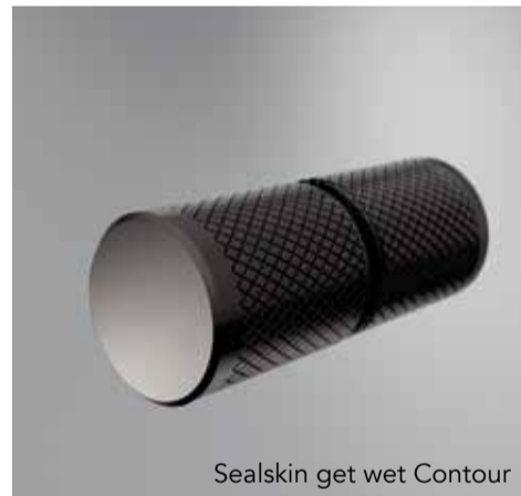
Sealskin get wet Contour