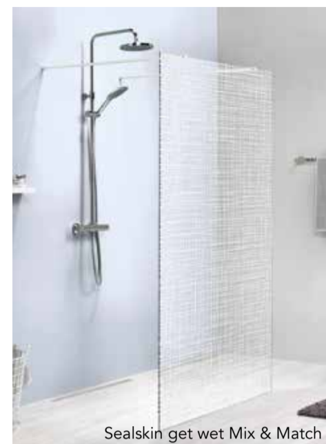
Sealskin get wet Mix & Match